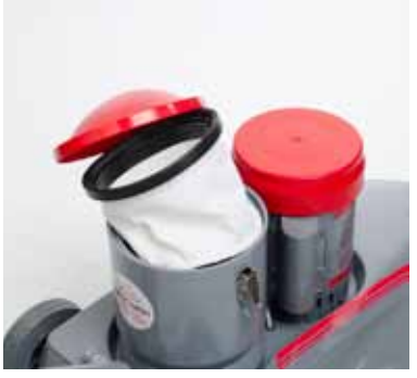
Efficient filtration. Making for a cleaner, more pleasant environment.