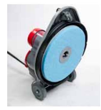
The speed and power of the direct drive will put a shine on your face and gloss on the floor.