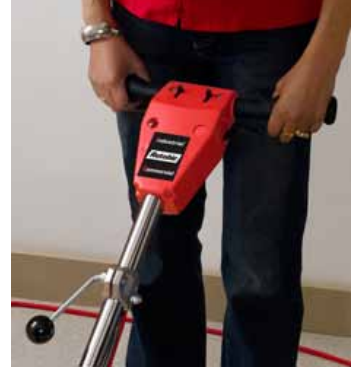
Classic Ergonomics. You already know how to use it.

Warranty:12 months parts & labour, conditions apply.