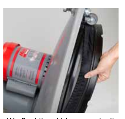
We float the skirt so you don't float in dust.