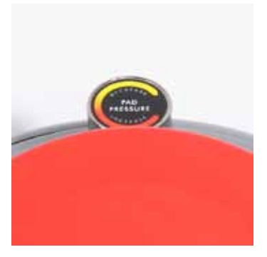
Don't judge the settings, judge the floor.