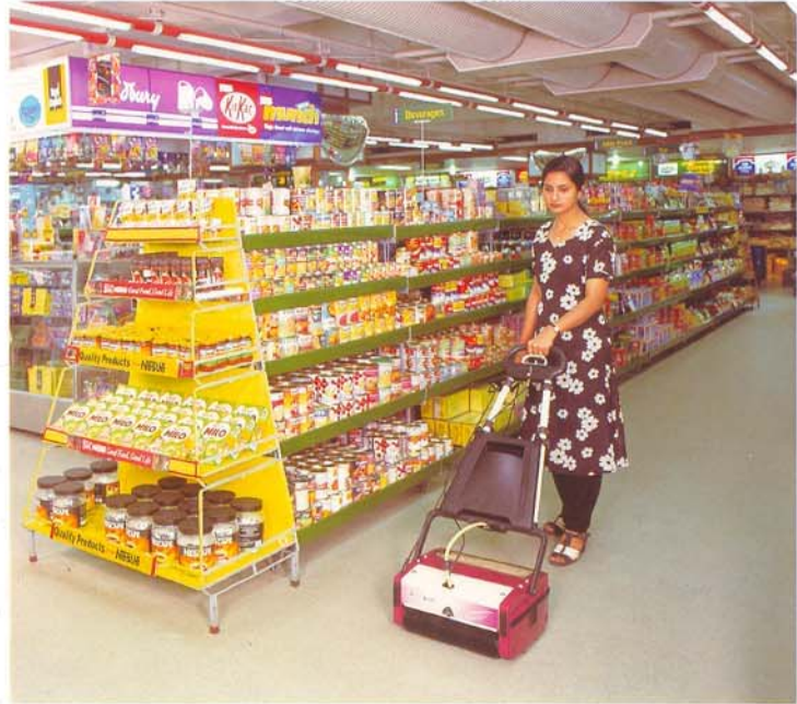
Ideal for small & medium size Super-markets

An unique, versatile high quality mini floor washing machine, designed to clean different types of floors. The compact and hi-tech design enables the machine to be operated under shelves, cots/tables and chairs where other machines normally cannot reach. The rugged design of the machine ensures trouble free and continuous operation. Different types of brushes are available to suit any type of floor including escalators. 4 stage brush pressure adjustment device is provided to compensate for the wear of the brushes which ensures optimum use of the brushes.