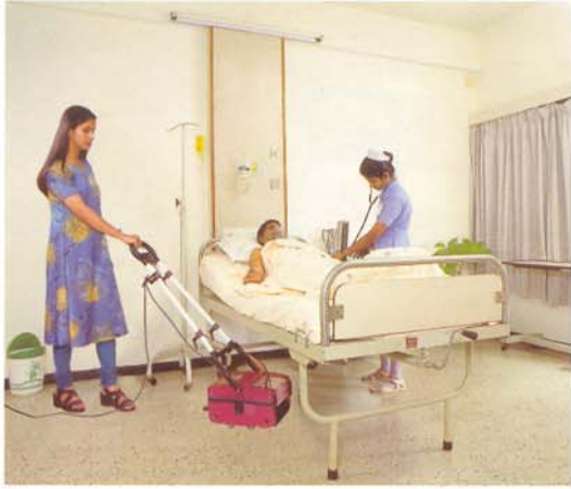
Ideal for hospitals because of the low noise level