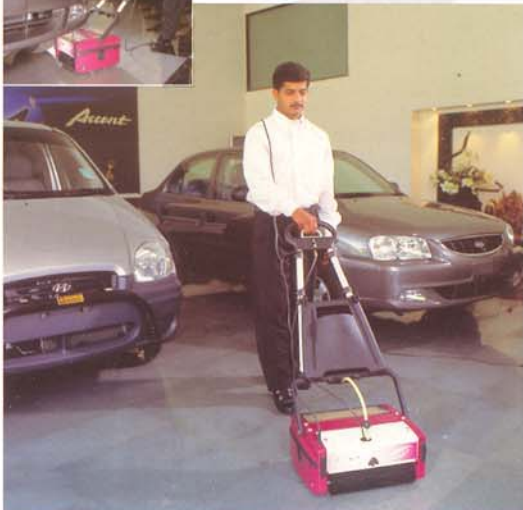
You just can't beat Wizzard