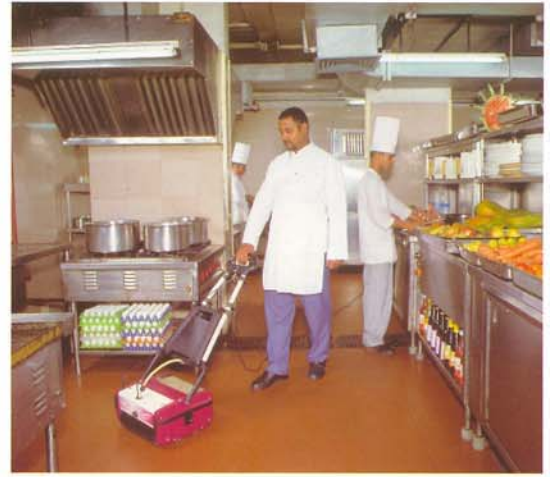
Essential tool for maintaining high level of hygiene for Hotel - kitchens and restaurants.