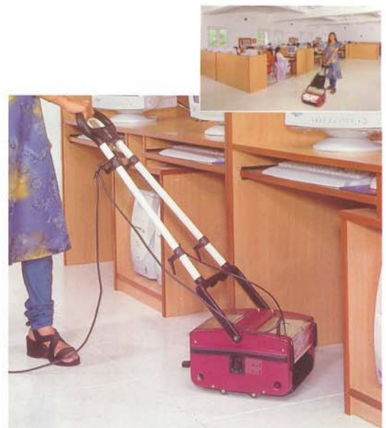
Easy manouverability and easy to reach beneath the furniture