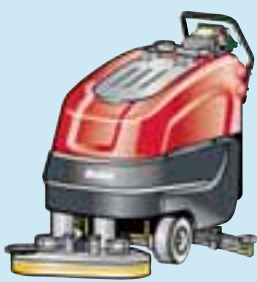
Hakomatic B 70