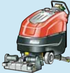
Hakomatic B 70 CL