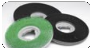
Pad Holder & Pad Holder “Short Trim” for G-Force & Focus.