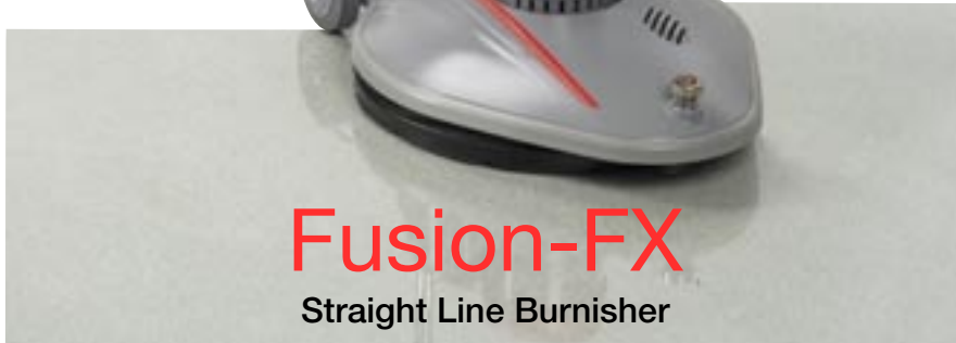
Fusion-FX Straight Line Burnisher

Don't judge the settings judge the floor.