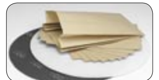
Sandscreen, Driver, Sandscreens (60# - 150# mesh), paper bags for G-Force Sander.