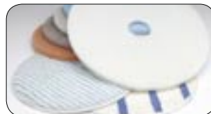
High speed pad for Fusion FX, Deep Scrub Pad and Carpet Bonnet for Focus.