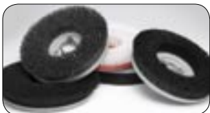
Bassine, Tynex & Nylon (Soft, Medium & Hard) brushes for G-Force & Focus.